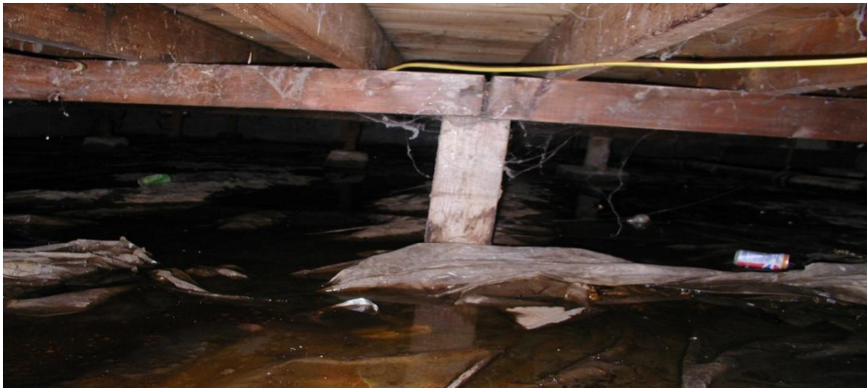
Figure 7. Standing water in a crawlspace: 40 percent of the air you breathe can come from the crawlspace, pulled up by the force of warm air rising. Excess crawlspace moisture is bad for your health, bad for the structure, and a significant factor driving relative humidity UP upstairs.

Standing water in a crawlspace under a building is nothing but trouble for landlords and tenants. This water is constantly evaporating, adding unplanned moisture to the air upstairs in the living area, making it that much more difficult to keep relative humidity under control.