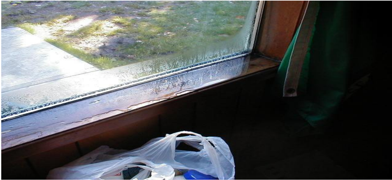
Figure 2. Too much moisture in the air (high relative humidity) leads to unwanted condensation on cool surfaces like double pane windows in cold weather. The moisture drips down, accumulates on sills, and can leak into wall cavities below causing hidden mold growth on wood and paper backed wallboard. Single pane windows will be colder still, resulting in condensation even with normal indoor humidity levels (below 40%) and may require daily drying of sills with towels to prevent mold growth and water damage.