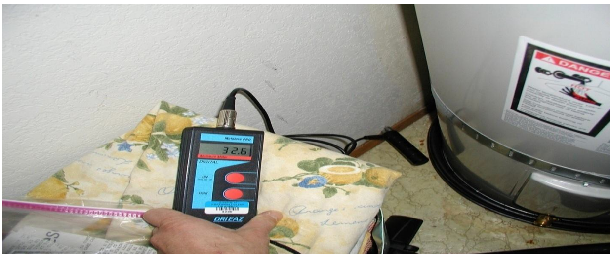
Figure 11. Plumbing leak: Hot water tank leaked and was replaced, but wallboard is still sopping wet (meter says 32.6; 28 is very wet) and mold will grow. This is where a moisture meter comes in very handy; finding damp materials adjacent to a leak before mold grows saves time and money for landlords...the meter may well “pay for itself.” This wet drywall, IF it can be saved, needs to be opened and aggressively dried using professional dehumidification techniques.

A very common mistake made by landlords even after successfully stopping a leak is failing to fully realize the scope of the resulting moisture penetration into building materials (Figure 11) . Typically, drywall, carpet, padding, and subfloors get wet from a bad leak. These materials must be aggressively dried to prevent mold growth, sometimes requiring professional assistance. Carpets may need to be lifted to rapidly dry the carpet, pad, and floor boards using dehumidifiers and fans. Drywall may need some holes drilled through it to get dehumidified air into the wall cavities to get things dry before mold gets started. The alternative, commonly, is mold growth, occupant exposure and property damage that will need more careful repair with mold contamination as a complicating factor (Figure 12).