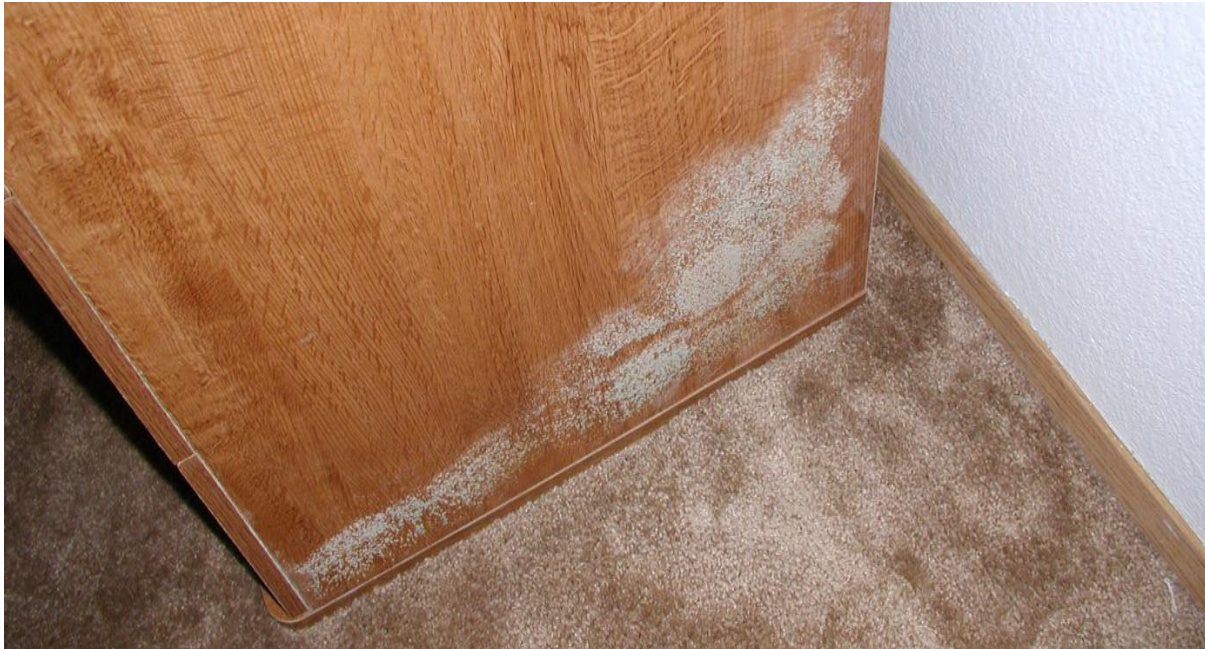
Figure 3. Mold growth caused by condensation on the cool cabinet placed against an exterior wall in a rental unit. The excessive indoor relative humidity (regularly exceeding 60%) was the culprit. This surface can be cleaned with soapy water.