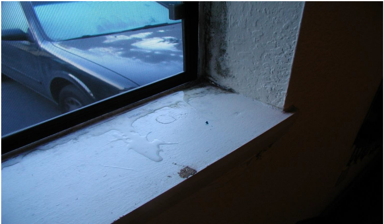
Figure 1. Condensation from excessive indoor moisture on the window glass drained and ponded on the window sill, soaked into and wicked up the drywall, and provided plenty of moisture to cause the black mold growth visible next to the window.

A mold problem always starts as an excess moisture problem. When mold appears, concerned tenants and landlords often “discuss” who is at fault, who should clean it up and how the cleanup should be done. Responsibility for mold growth usually depends on the cause of excess moisture.