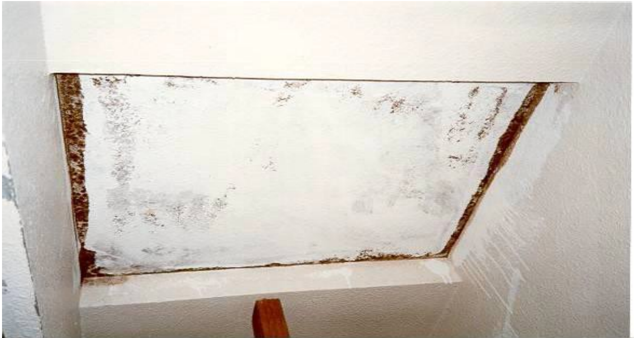
Figure 13. Drywall covered with mold needs to be carefully removed. Painting over mold is not acceptable work practice.

All too often, we see unprotected workers cut out mold-covered drywall that they then haul through the rental to the dumpster with no precautions whatsoever to prevent spores released in the process from contaminating the occupants' belongings.