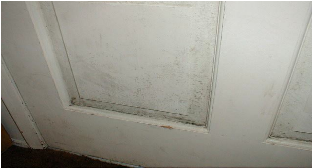
Figure 6. Condensation: Mold growth on inside surface of exterior door. Again, cold surface meets moist air, gets wet and supports mold growth. This can be washed off and repainted.