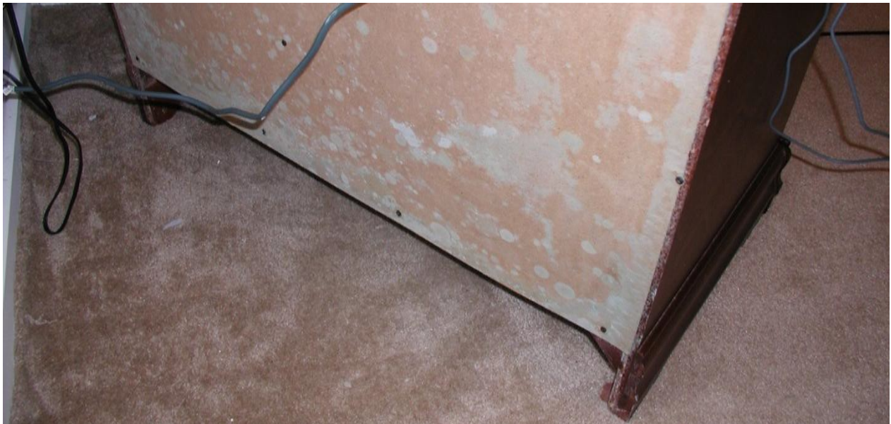
Figure 4. Condensation: Tenants kept the apartment at 60 degrees, cold enough that the back side of their dresser was below “dew point”, the temperature at which typical moisture levels in the air will condense on a surface. With the dresser chronically wet, mold got started and amplified. This can probably be scrubbed off (outside!) and painted. To prevent a recurrence of the mold, surfaces need to be kept warmer either by increasing the apartment temperature and/or allowing air circulation behind the dresser, or lowering the relative humidity in this space.