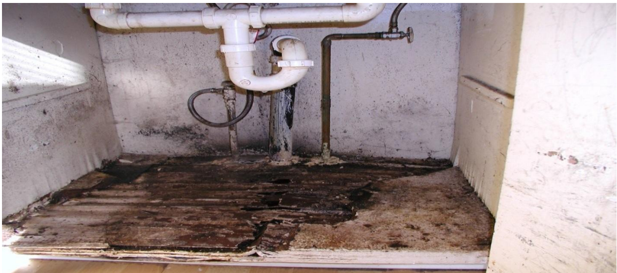
Figure 9. Plumbing leak: Prompt communication with a landlord could have prevented this damage.

Leaks are generally the landlord's responsibility. Of course the landlord typically won't know about a new leak unless informed by the tenant. The sooner a tenant notifies the landlord of a leak, the less likely surfaces will stay wet long enough to grow mold. Mold can get started in a couple days, so, you know, don't delay. We won't discuss fixing the source of leaks; just emphasize the hazards of delaying response to leaks.