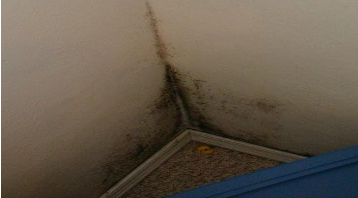
Figure 5. Condensation: Mold growth in bedroom corner of exterior wall. The combination of high relative humidity from occupants breathing all night (exhaling water vapor) and the cool surfaces of the exterior wall led to condensation and mold growth.