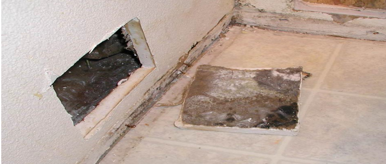
Figure 12. Saturated wallboard must be aggressively dried or mold WILL grow, often on the hidden paper backside of the wallboard in the wall cavity. This moldy wallboard should be carefully abated using a negative pressure enclosure and respiratory protection for workers.

Here is an example of missed moisture following a plumbing leak: Let's say a hot water tank leaks and soaks surrounding carpet for a couple days before it gets noticed. The landlord gets the water heater replaced and, in good faith, authorizes aggressive drying of the carpet and pad. But the adjacent drywall has wicked up some moisture that can't be obviously noticed without a moisture-sensing meter (Figure 11). Saturated drywall WILL get moldy (Figure 12). The best solution for do-it-yourselfers is to use a moisture meter to test the walls and ensure they are below 16 percent or so. Above 18 percent moisture content, drywall will typically support mold growth.