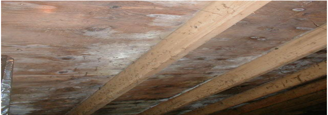
Figure 8. Condensation: Mold growing on roof "sheathing" in an attic. In winter months, moisture (water vapor) leaking through the ceiling of the living area with the force of warm air rising will condense on the cold attic sheathing, causing property damage and mold exposure to occupants. Left uncorrected, the roof will fail and need replacement.

When a crawlspace is as wet as Figure 7, this evaporative water vapor often passes through the house with the force of warm air rising until it reaches the cold underside of roof sheathing and condenses, leading to attic mold growth (Figure 8).