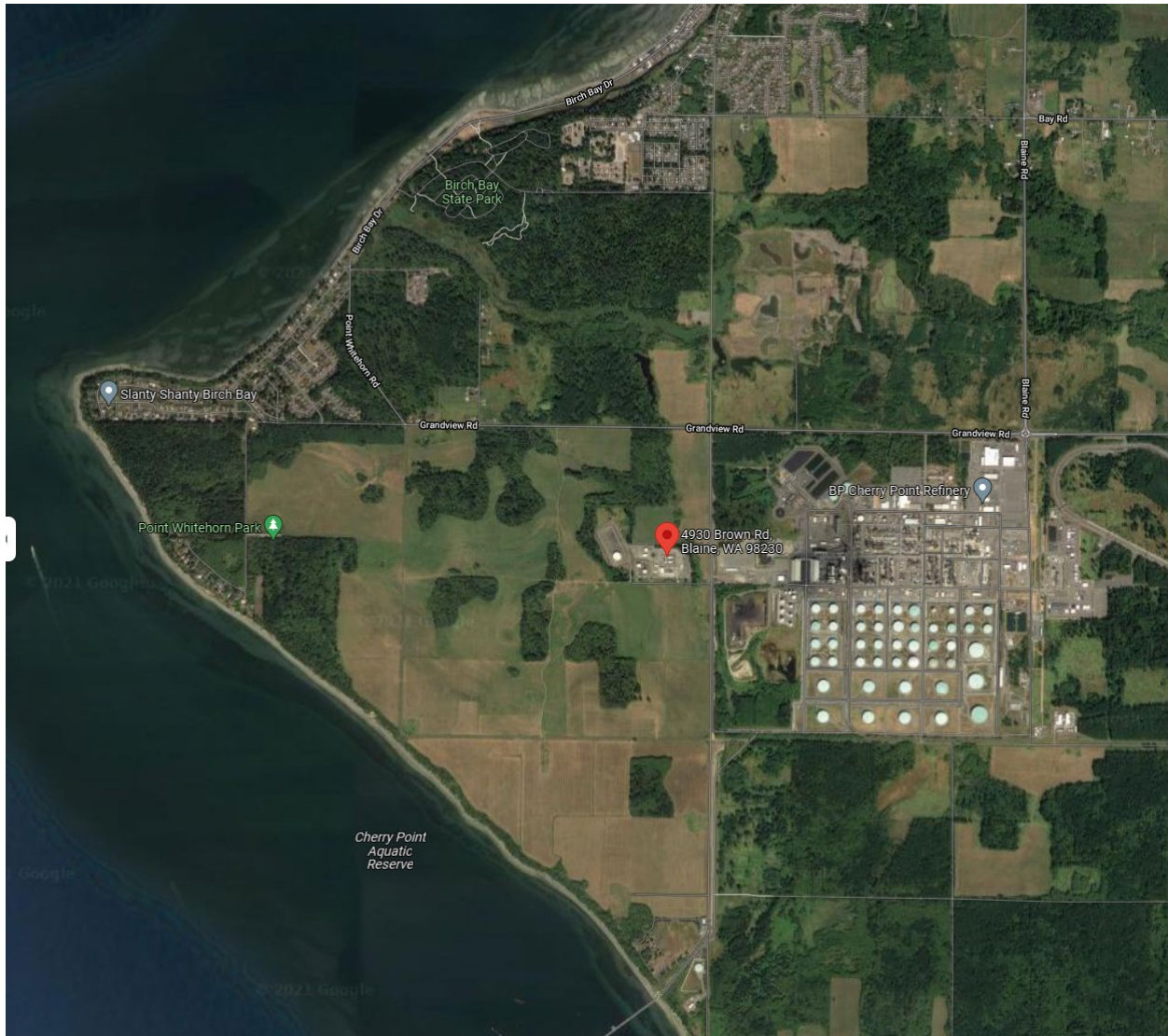
Figure 1 PSE Whitehorn Location Map

PSE Whitehorn is a fossil fuel-fired, combustion turbine facility designed to generate electrical power for PSE customers. The facility can run on a continuous basis; however, due to economic and system conditions, the facility only runs intermittently as a peaking plant. The Whitehorn Generating Station is located west of the BP Cherry Point refinery in Whatcom County (see Figure 1).