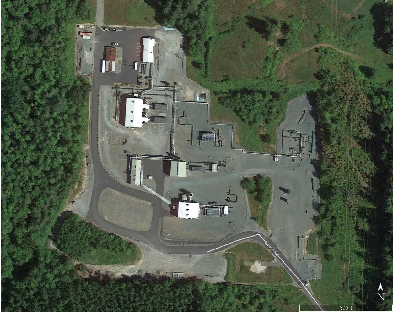
Figure 2-2 Aerial photograph of NWP-MVCS (July 2018)