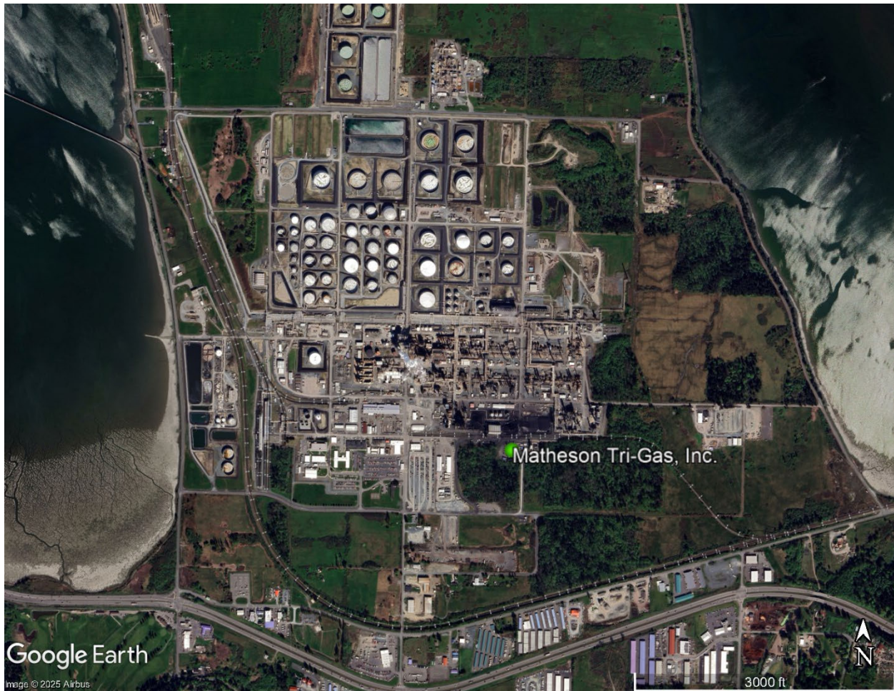
Figure 1-1 A view of the Nippon Sanso Matheson facility (position marked by green dot), with the PSR to the north (photo from Google Earth, accessed on 1/15/2025. Imagery Date: 4/16/2024).