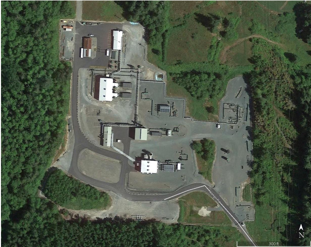
Figure 2-2: Aerial photograph of NWP-MVCS (July 2018)