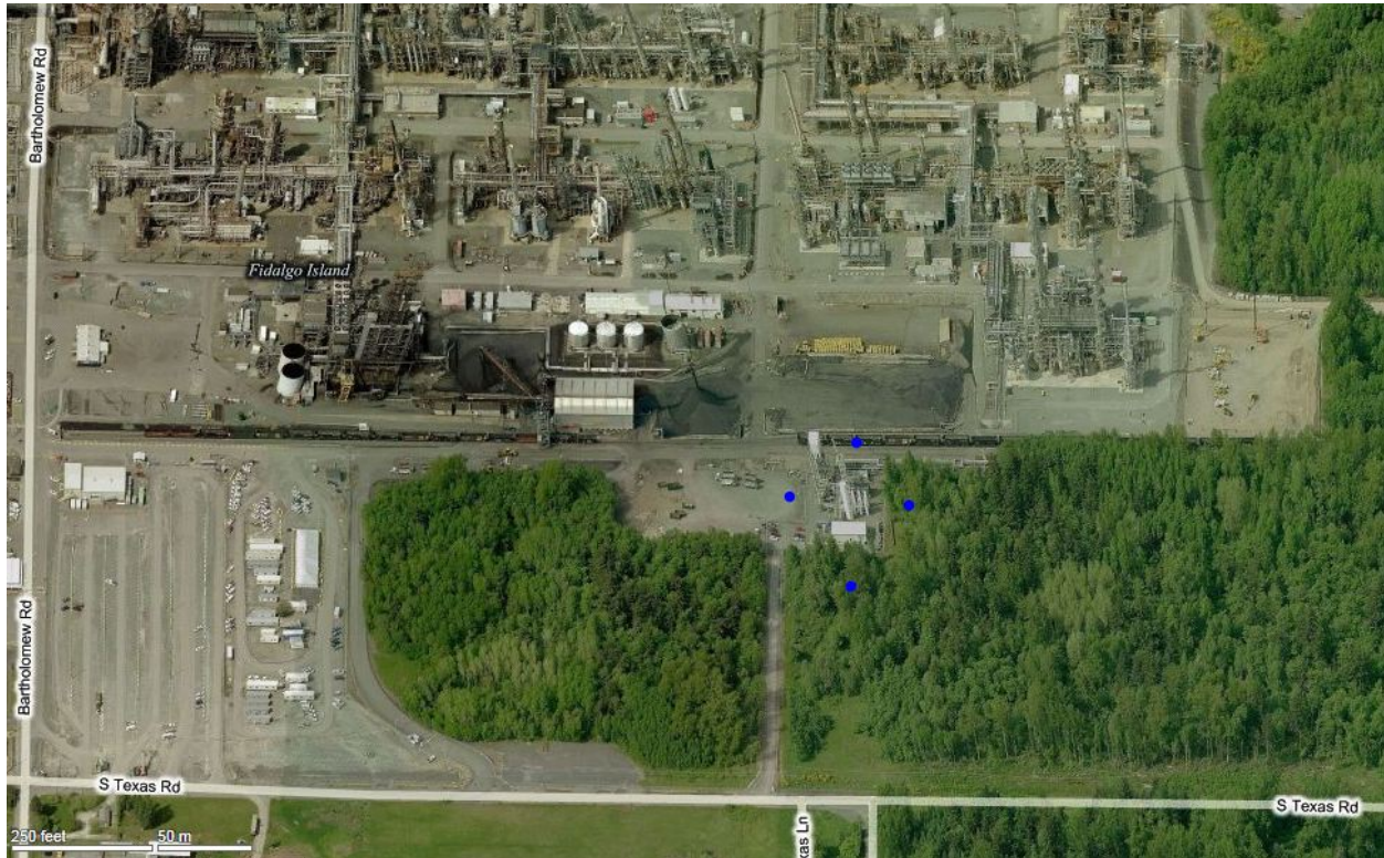
Figure 2-2 A view of the Air Liquide facilities (surrounded by blue dots), with the PSR refinery to the north.