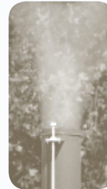
20% Opacity (legal)

Smoke density is referred to as opacity. State law limits the density of chimney smoke to 20% opacity.* 0% opacity means no smoke, 100% opacity is smoke so thick you can't see through it, with 20% opacity, smoke is barely visible.