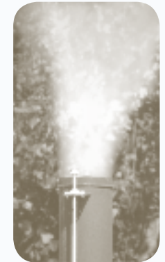
80% Opacity (illegal)

*Smoke density can exceed this limit for 20 minutes every four hours to start a fire and for six minutes once every hour to refuel the fire.