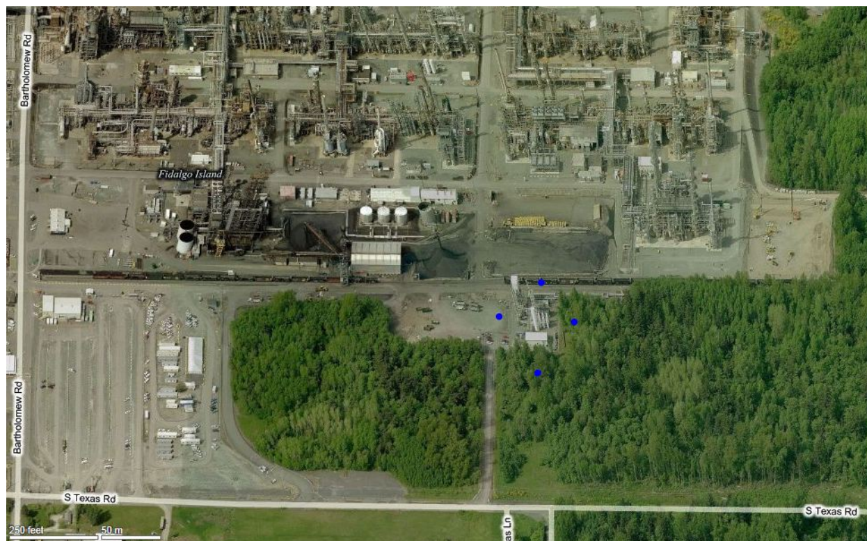
Figure 2-2 A view of the Air Liquide facilities (surrounded by blue dots), with the PSR refinery to the north.