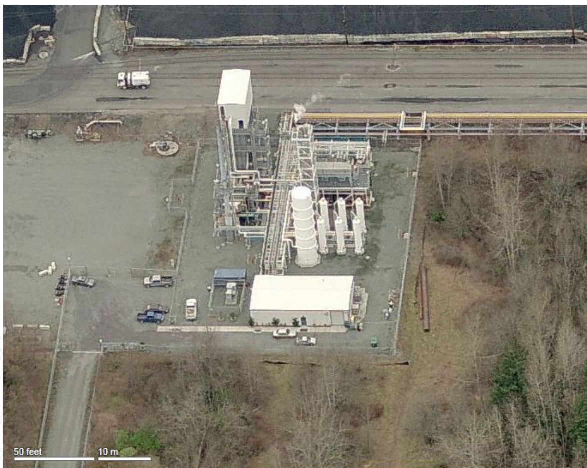
Figure 2-1 An aerial photograph showing the Air Liquide facilities at Anacortes, WA.

Aerial photographs showing the facility are shown in Figure 2-1 and Figure 2-2.